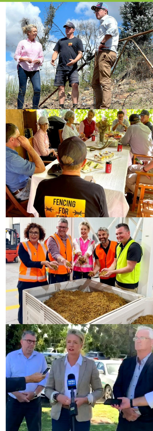
Senator Bridget McKenzie

What is Manufacturing 2035? visit vicn.at/manufacturing-2035